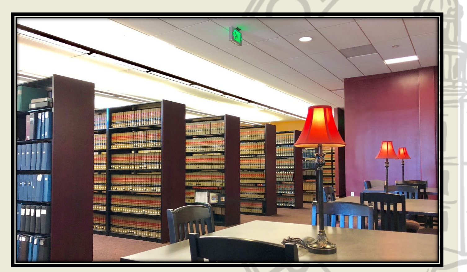
Law Library Reading Room