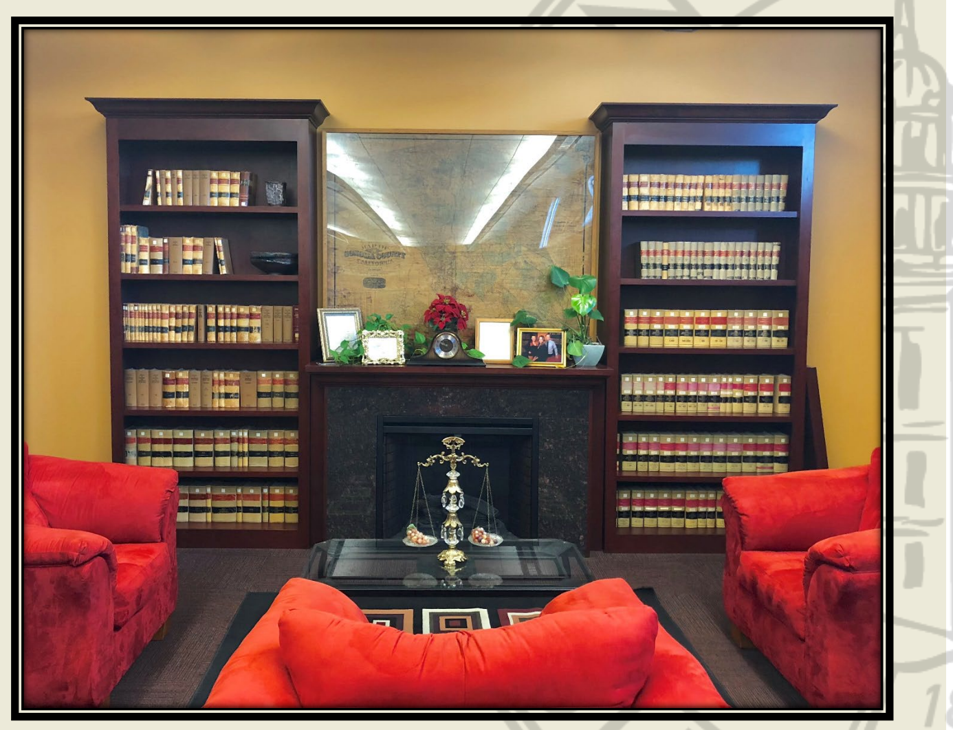
Law Library Reading Room