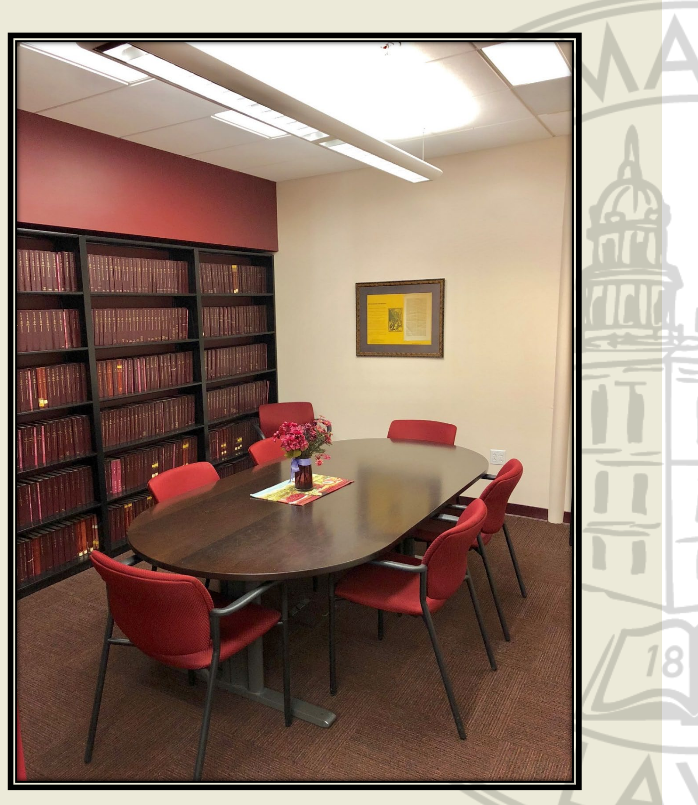
Kimberly Tucker Conference Room