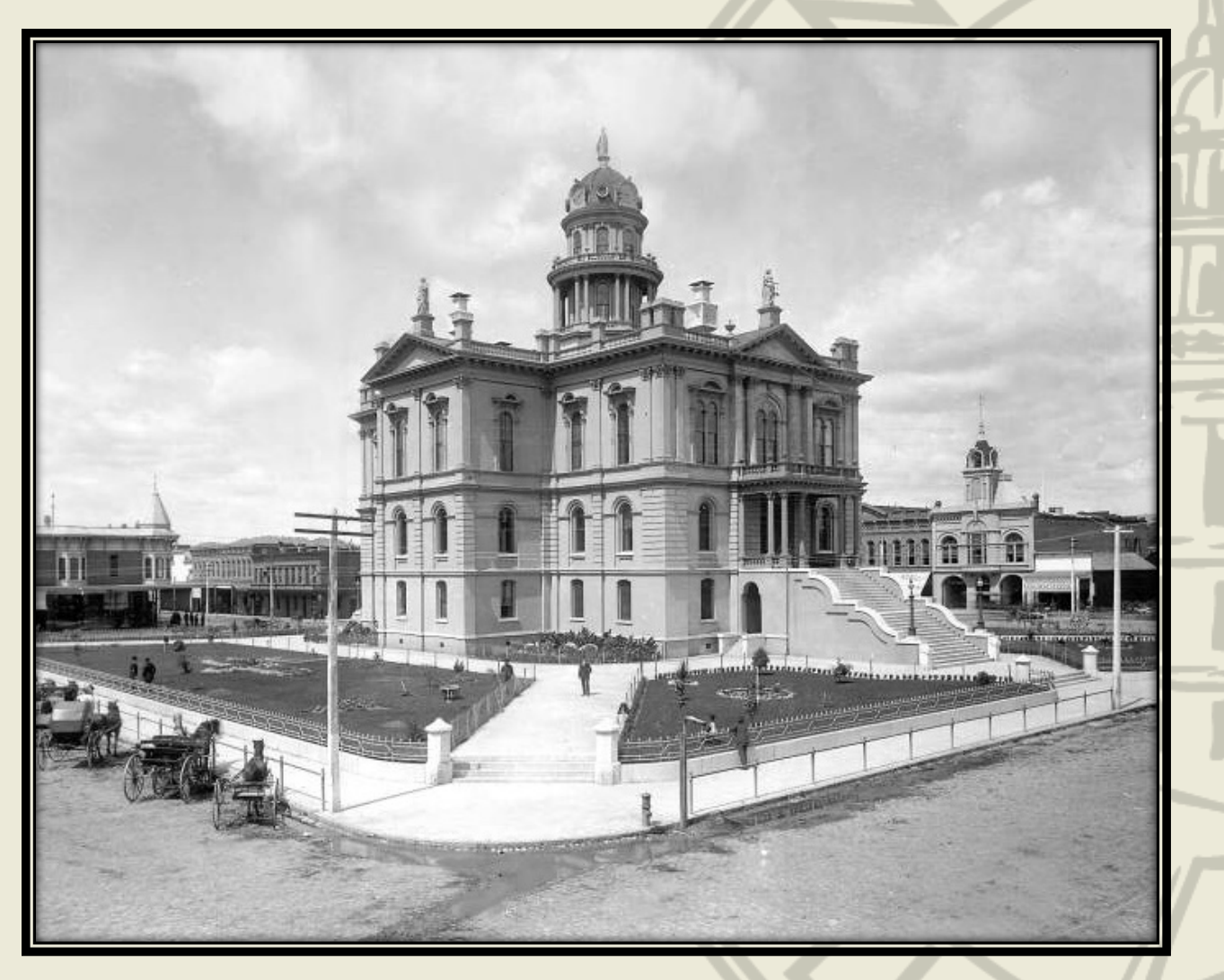
Sonoma County Old Court House