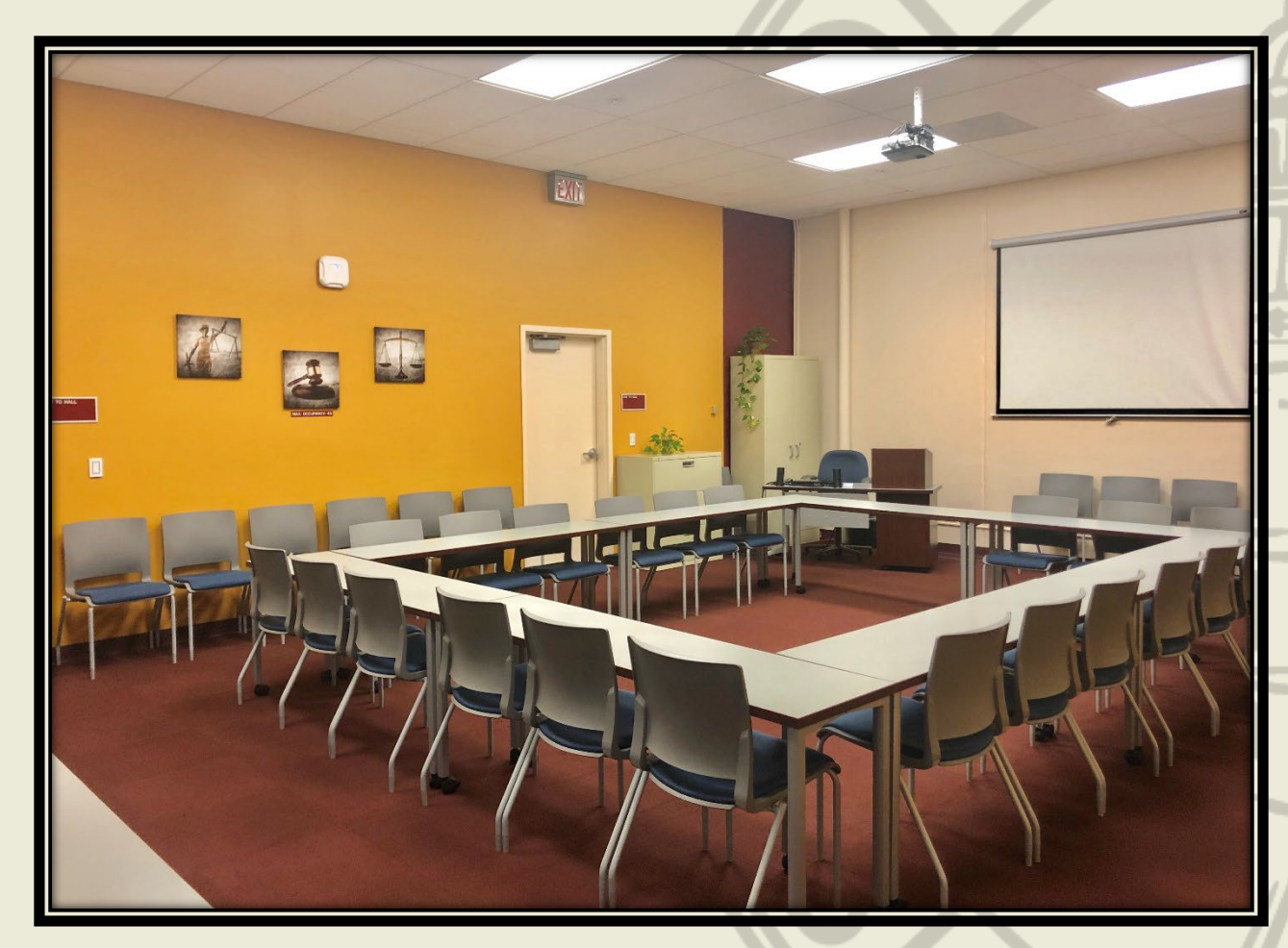
Judge Gayle C. Guynup & U.S. Rep. Douglas H. Bosco Conference Room