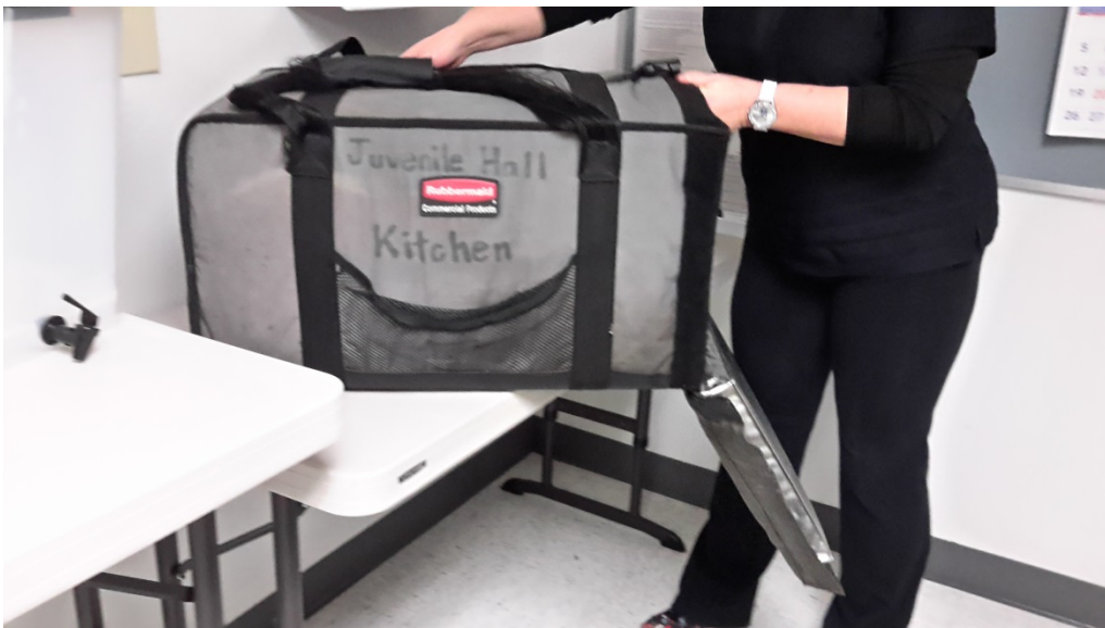
Day Reporting Center Food Carrier with Food and Trays- up to 23 lbs. - carried 25 to 50 feet