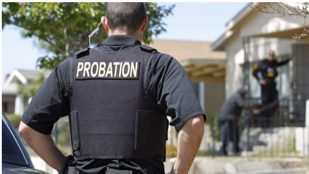
Example of Ballistic Vest