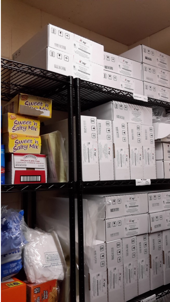
Day Reporting Center Urine Drug Screen Supplies- weight – 5lbs. Stored up to 72.5” high