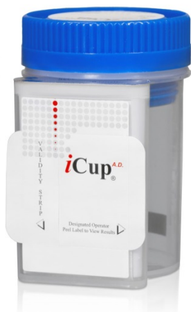
Example of iCup Urine Drug Screen Cup used for Substance Abuse Surveillance