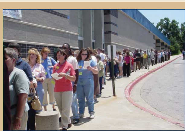
Volunteers wait in line at a dispensing exercise.

But not for you and your employees. You planned ahead, and are activating your CLOSED Dispensing Site. Your employees know that they and their families can avoid the public dispensing sites and get their medications at work. With important paperwork already on file, the process is quick and easy. Your employees and their families are protected from harm, and your business keeps running smoothly.