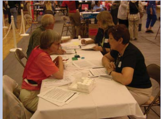
Practice your plan before an emergency occurs.