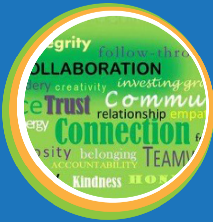
Report from the Front Lines: Stories of Lived Experience from our Community Mental Health Service Heroes