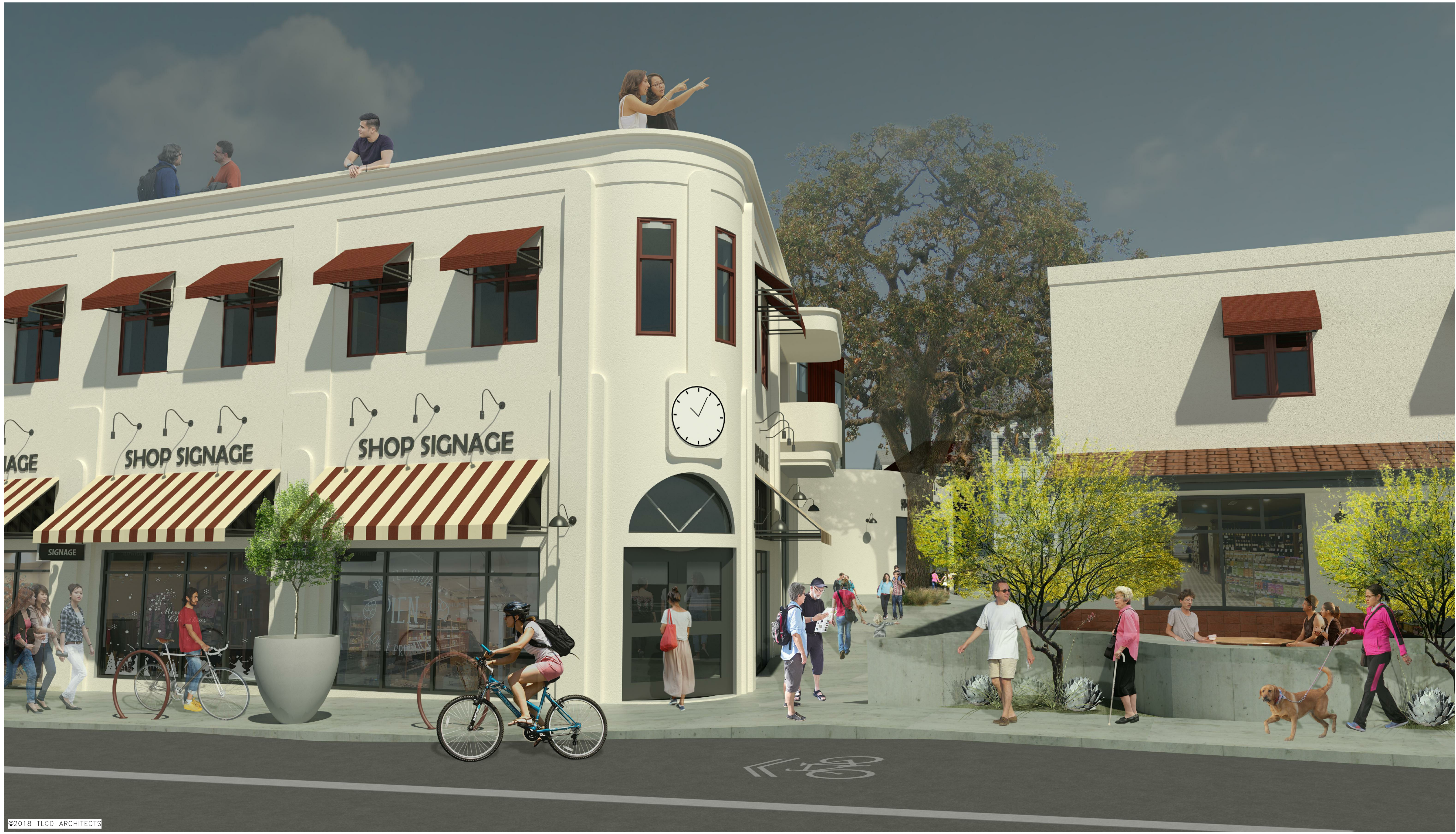
1 | VIEW OF PEDESTRIAN PROMENADE FROM HIGHWAY 12 12" = 1'-0"

© 2021 inf3 - Drawings furnished by inf3 are and shall remain its property. Drawings and specifications to be used only for this project, and no relaxation of copy right is implied by distribution or submission for municipal agency and/or regulatory approval. - BJH, AIA