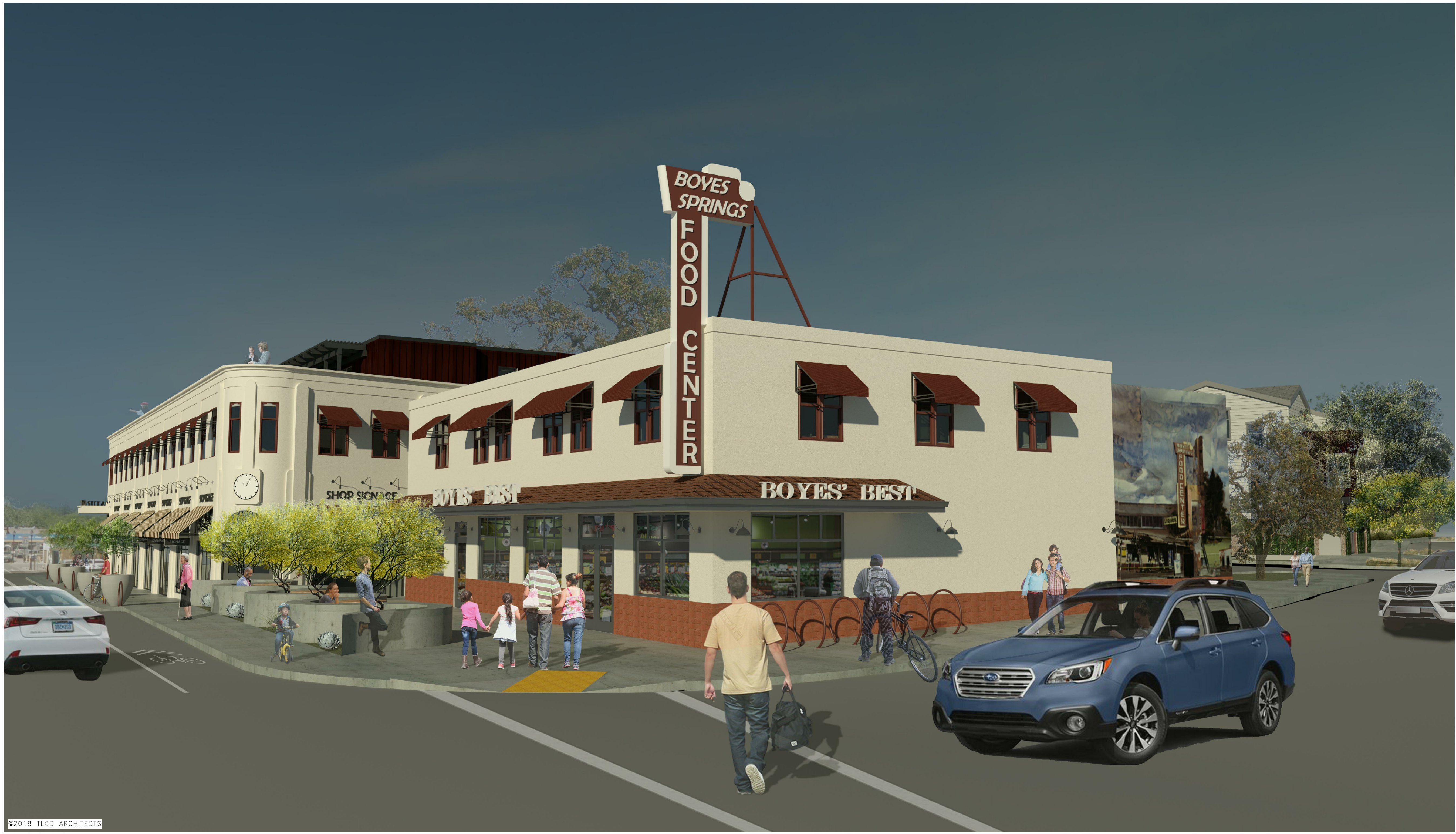
1 VIEW FROM SOUTHWEST 12" = 1'-0"