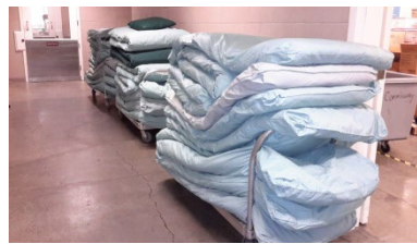
Mattress and Pillow- 30 lbs. Lifted up to 72-inches