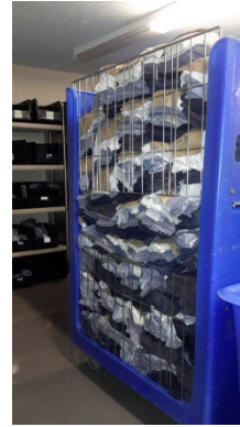
Laundry Cart for Module- handles at 52 inches Push force of 71 lbs. - distances up to ¼ mile Pull force of 55 lbs. (Push/pull force measured with cart full)