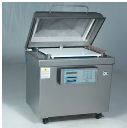
CPI/Guardian Property Room Expander Vacuum Sealer- inmate belongings Handle from 64" to 24"; 20 to 25 times/day