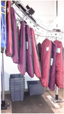
Property/Belongings bag- up to 28 lbs. Over-head lift up to 84 inches