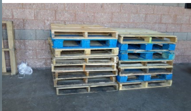
Pallets 40"x47"x4.5" – 65 lbs. On dock stacked to 36-inch height