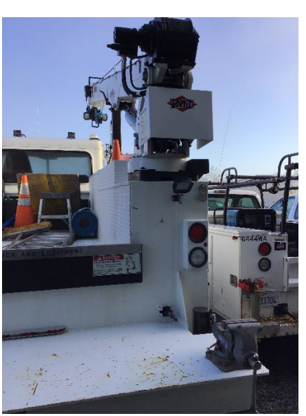
Work truck with crane for lifting heavy items