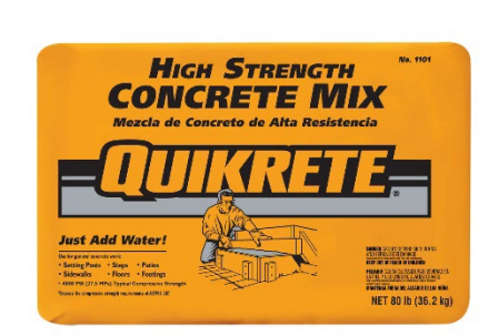
Bags of Concrete – Up to 80 lbs.