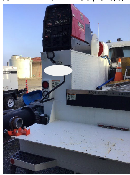
Welder/Generator Mounted on truck