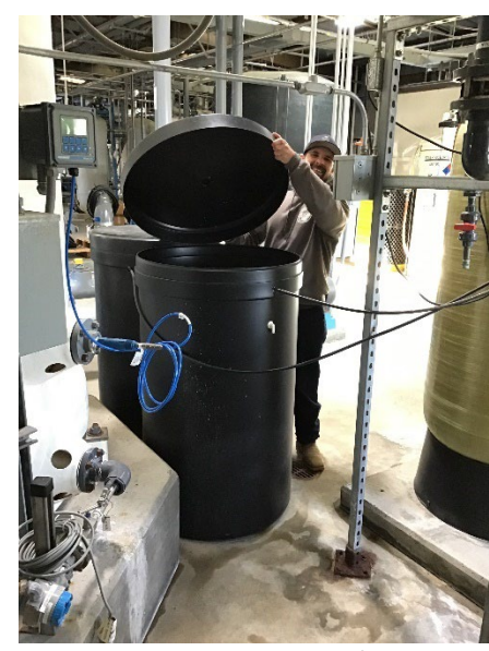
Salt added to Conditioner/Softener 40lbs. from 6-inches to 48-inches high