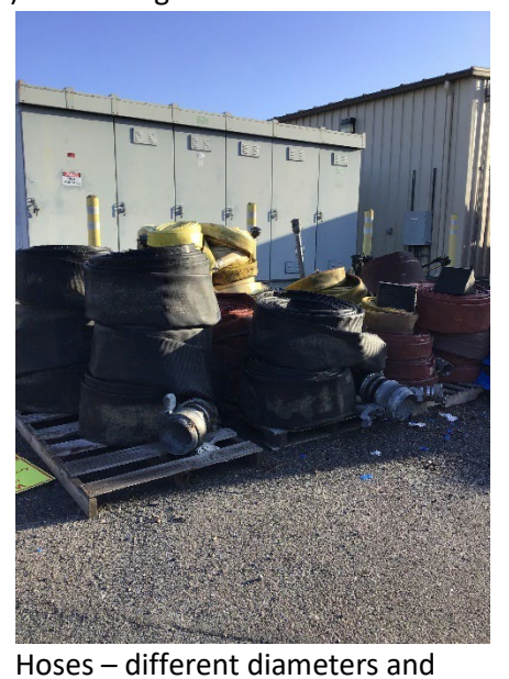
weights – up to 62 lbs. Loaded to trucks on pallet with fork lift