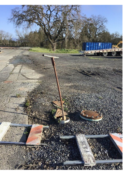
Sample of Handle to "exercise" valves ~48" high