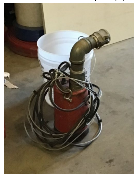
Pump = 40 lbs. Carried 20'-25' floor to work truck (Truck bed = 39" high)