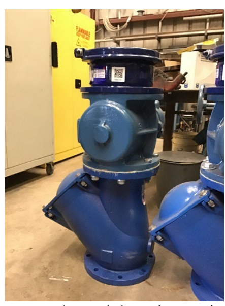
Pump, Valve, and Flange (3 pieces) 3-person team to change