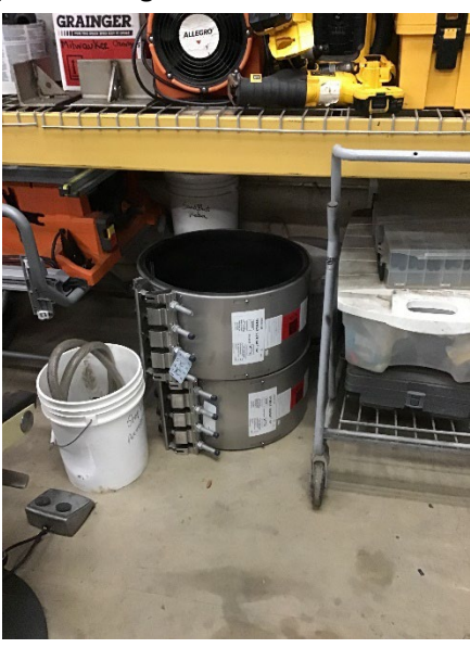
Coupling and Repair Clamps – 48lbs. Carried 20'-25' floor to work truck (Truck bed = 39" high)