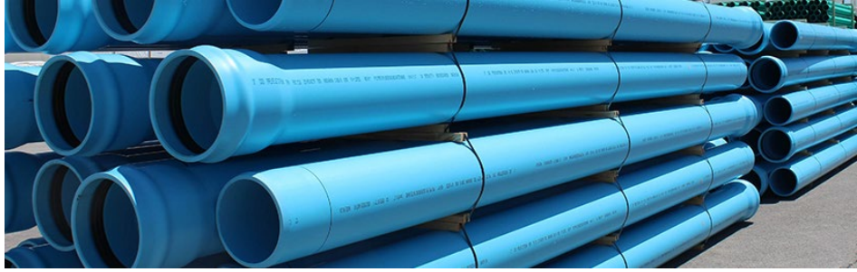
C900 PVC Pipe may be loaded to Lumber Rack (80" high) — Pipe size may vary from diameter of 4" to 24"; typically delivered at 20' long