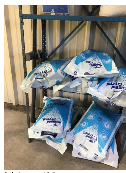
Salt bags – 40 lbs.