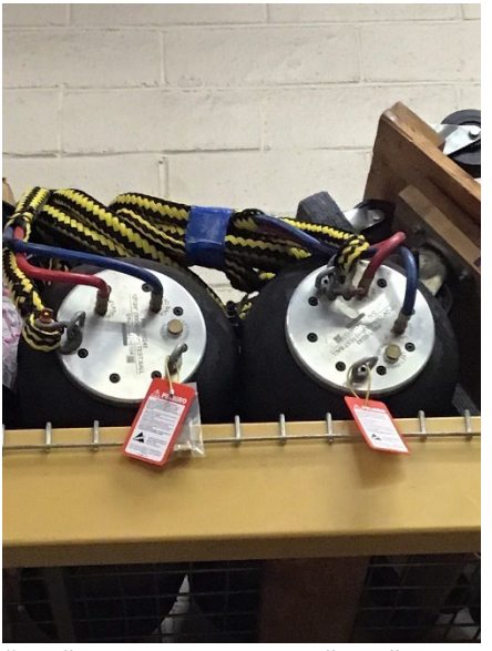
"PIG" Test-Ball Plug -24" - 48" = 12\overline{5} lbs. Pictured 12"-24" = 26.9 lbs. (stored overhead) Variable weight depending on diameter