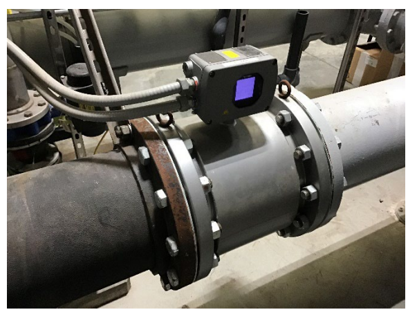
Meter – install; monitor; repair, as needed -Found a various heights (Site specific)