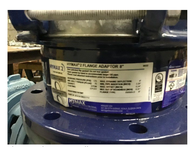
Flange Adaptor = 32 lbs.