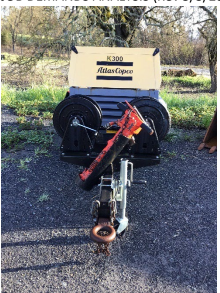
Jack Hammer - 92 lbs.