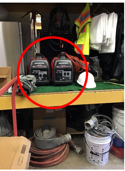
Generator 50lbs. on 34-inch shelf Carried 20'-25' floor to work truck (Truck bed = 39" high)