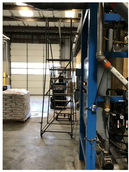
Safety Ladder for overhead work-Acid lines, Filter Lines, Overhead Meters