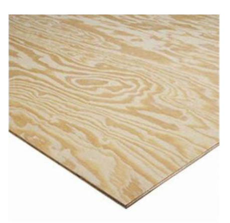
Plywood – 4' x 8' x \frac{1}{2} " = avg. 43 lbs.

Lead Mechanics and Mechanics work in a variety of locations and settings throughout Sonoma County. Mechanical lift assists (i.e., hoist; fork lift; crane; winch; trolley, cart or hand truck) are used, when possible. Below is a sample of Items and ranges of heights that items will be handled: