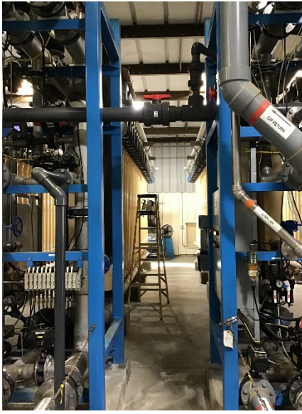
Ladder in place for overhead work-Acid lines, Filter Lines, Overhead Meters (May climb ladders with hand tools, flash light)