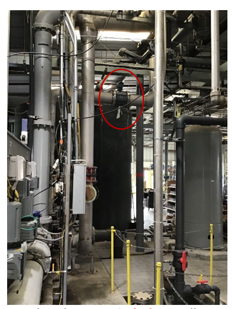
Overhead Meter circled - Install; monitor; repair, as needed