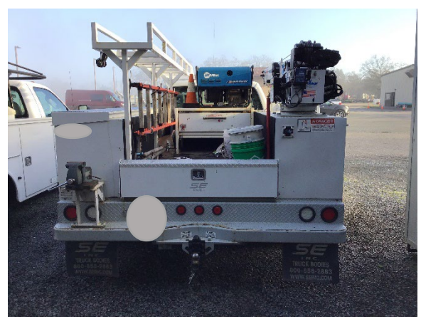
Work truck- Lumber Rack 80-inches high