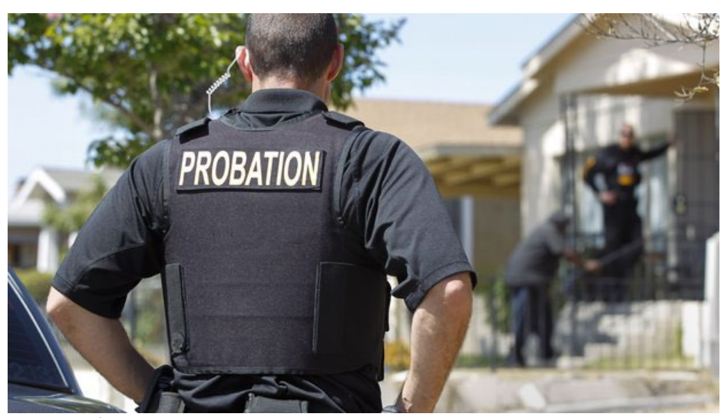
Example of Ballistic Vest