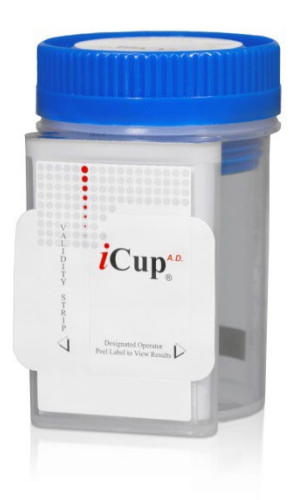
Example of iCup Urine Drug Screen Cup used for Substance Abuse Surveillance