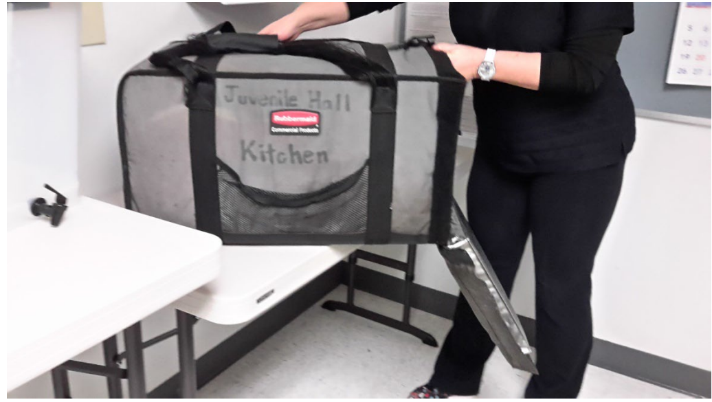
Day Reporting Center

Food Carrier with Food and Trays- up to 23 lbs. - carried 25 to 50 feet