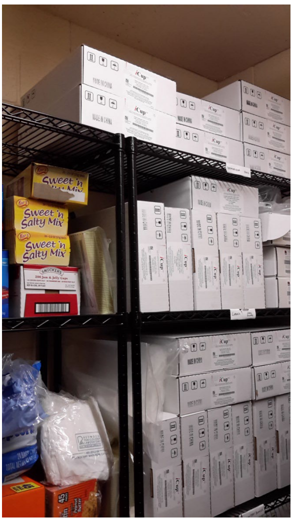
<u>Day Reporting Center</u> Urine Drug Screen Supplies- weight – 5lbs. Stored up to 72.5" high