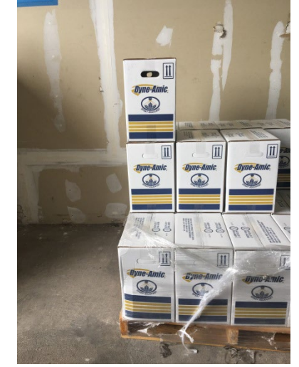
Cases stored from 6" to 52"