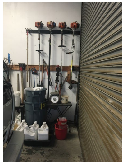
Pole Saw- weighing up to 13 lbs. Weed Whacker- 17 lbs.