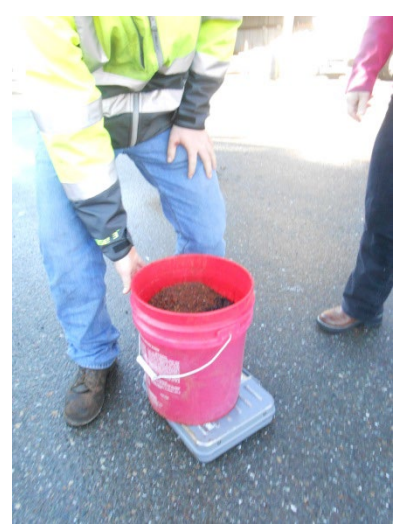
Cold Mix Bucket- 50 lbs.