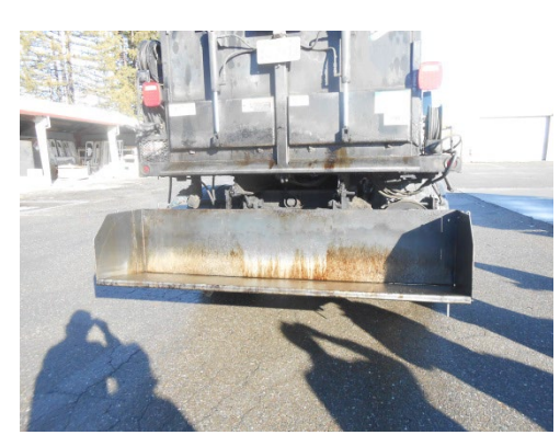
Bobtail Asphalt Patch Truck – 19 inches to lowered gate.