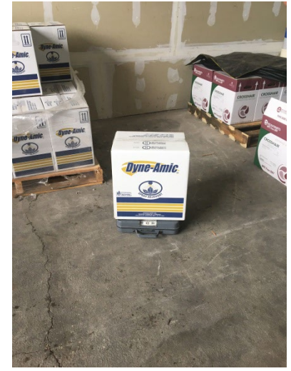
Case of Herbicide- 40 lbs. Case Handle at 13 inches