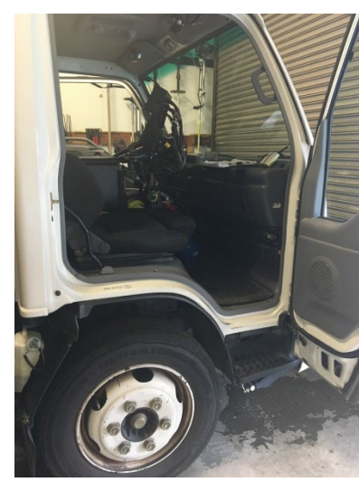
Passenger side of Spray/Tank Truck

Controls for Spray/Tank Truck-Typically controlled by passenger