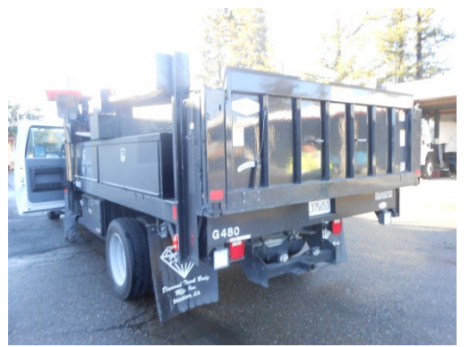
Work Truck with Lift, step to enter Driver's side 16 inches