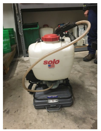
4 Gallon Spray Back Pack-( Typically filled with ONLY 3 Gallons ) Empty- 10 lbs.; Plus 3 Gal. - 35 lbs. ; Plus 4 Gal. - 43 lbs.