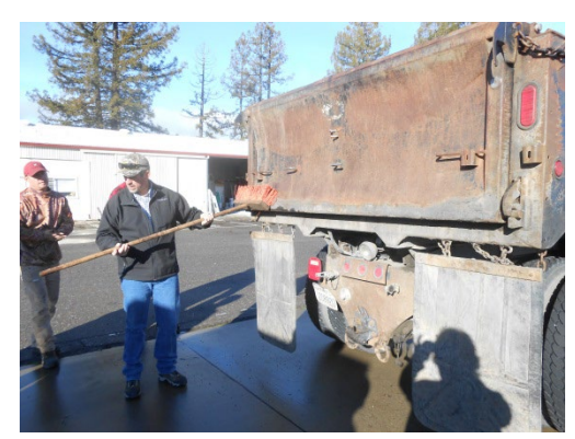
Bobtail Dump Truck- 39 inches to Bed of truck/gate