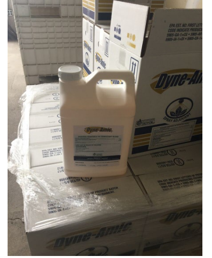
Single container of Herbicide= 18lbs. Moved from 6" pallet to 55" Utility Storage on Pick-up truck