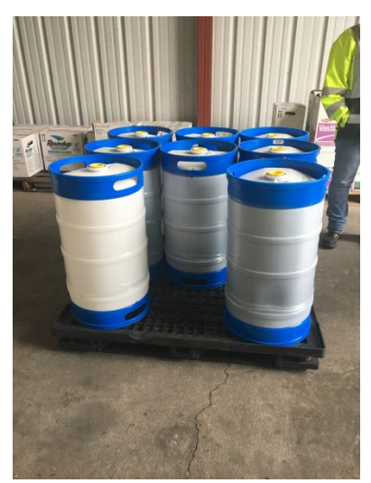
Full Herbicide- 15 gal. = 125.1 lbs. Lowered from 6 in. surface to ground

Utility Bed on Pick-up Bottom of Storage at 55" from ground-Storage for Herbicide or chainsaws