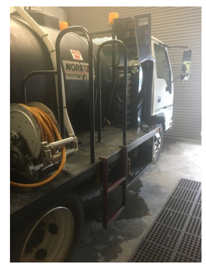
Side of Spray/Tank Truck- Portable Ladder Steps at 12" – 24" – 36" to bed of truck