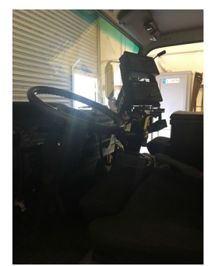
Driver's Side of Spray/Tank Truck