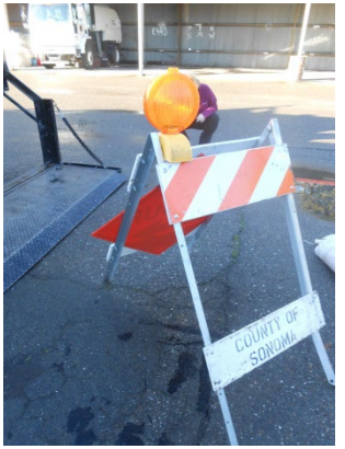
Traffic Barricade with sign- 17 lbs.