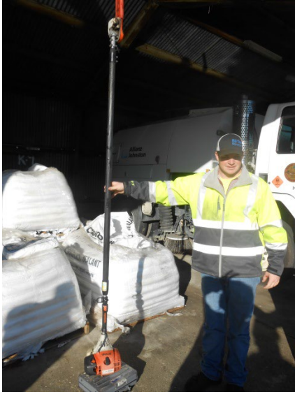
Pole Saw – 17 lbs. Shortest at 107" Extends to max of 180" (15')