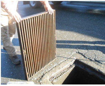
Grate Inlet - Avg.= 100 lbs.