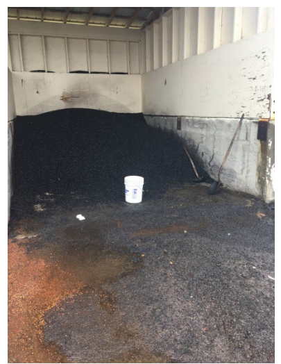
Cold Mix Asphalt Repair Material Shovel and 5 Gallon Bucket for Pot hole repair