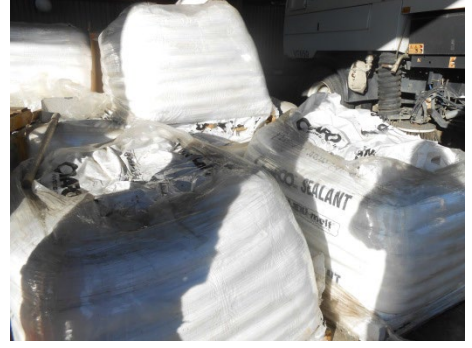
Crack Sealant- 25 lbs. per bag 50 bags per pallet