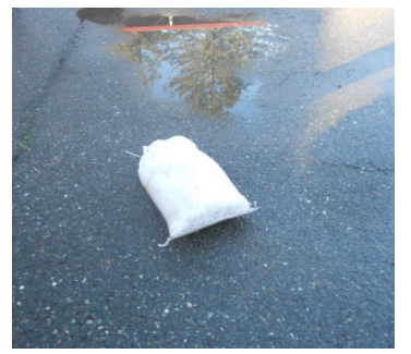
Sandbag- 28 lbs.