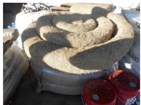
Straw Wattle - 35 lbs.