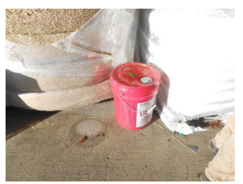
Pavement Finisher Bucket- 40 lbs.