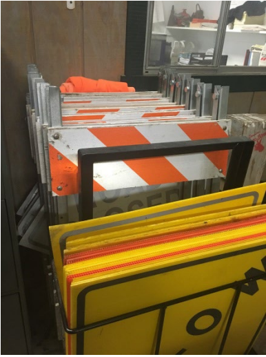
Barricades- 15 lbs.