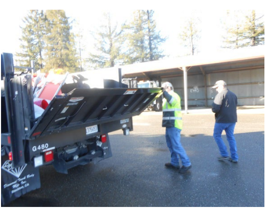
Work Truck with Lift