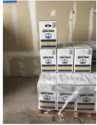
Cases stored from 6" to 52"