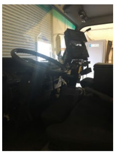
Driver's Side of Spray/Tank Truck