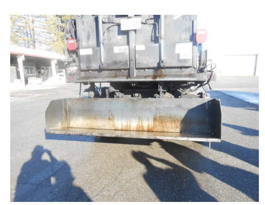
Bobtail Asphalt Patch Truck – 19 inches to lowered gate.