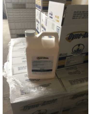
Single container of Herbicide= 18lbs. Moved from 6" pallet to 55" Utility Storage on Pick-up truck