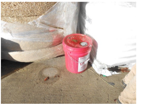
Pavement Finisher Bucket- 40 lbs.