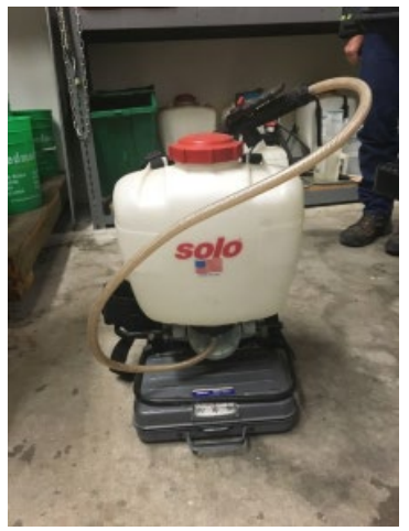
4 Gallon Spray Back Pack-(Typically filled with ONLY 3 Gallons) Empty- 10 lbs.; Plus 3 Gal. - 35 lbs. ; Plus 4 Gal. - 43 lbs.