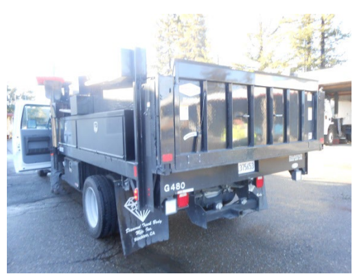
Work Truck with Lift, step to enter Driver's side 16 inches