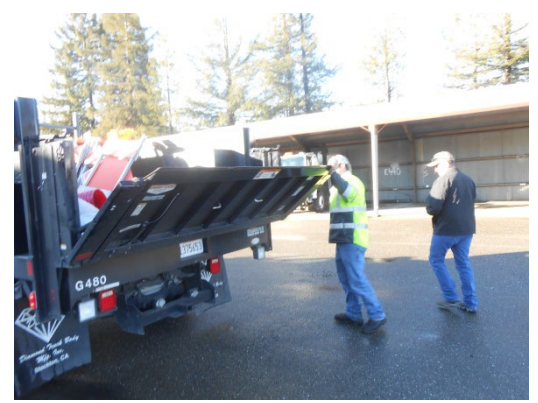
Work Truck with Lift