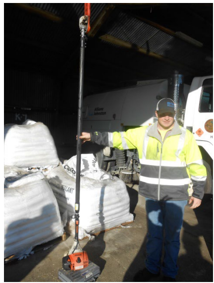
Pole Saw – 17 lbs. Shortest at 107" Extends to max of 180" (15')