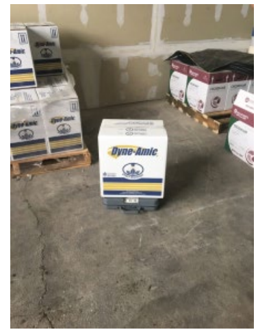
Case of Herbicide- 40 lbs. Case Handle at 13 inches