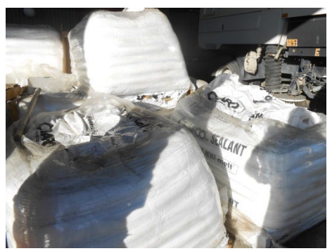
Crack Sealant- 25 lbs. per bag 50 bags per pallet