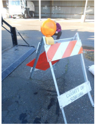
Traffic Barricade with sign- 17 lbs.