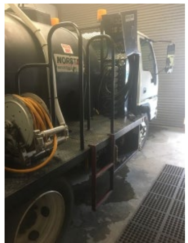
Side of Spray/Tank Truck- Portable Ladder Steps at 12" – 24" – 36" to bed of truck