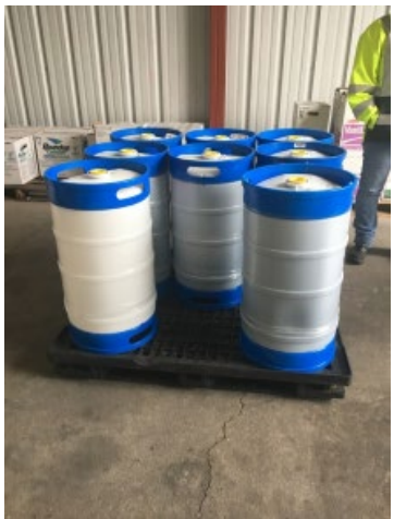
Full Herbicide- 15 gal. = 125.1 lbs. Lowered from 6 in. surface to ground