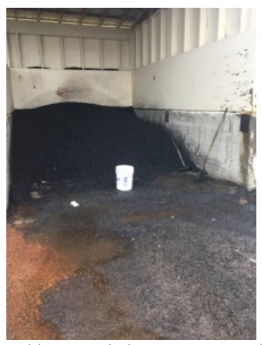
Cold Mix Asphalt Repair Material Shovel and 5 Gallon Bucket for Pot hole repair