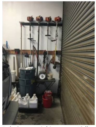
Pole Saw- weighing up to 13 lbs. Weed Whacker- 17 lbs.