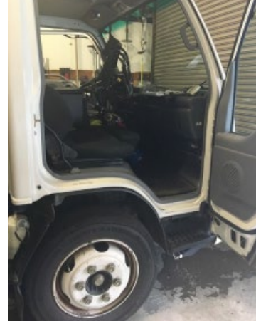
Controls for Spray/Tank Truck- Passenger side of Spray/Tank Truck Typically controlled by passenger