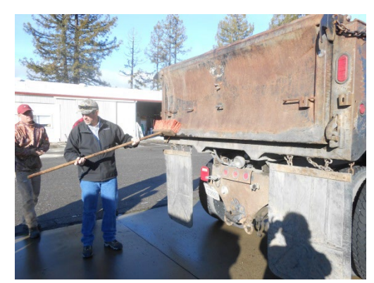
Bobtail Dump Truck- 39 inches to Bed of truck/gate