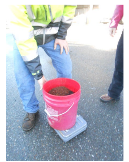
Cold Mix Bucket- 50 lbs.