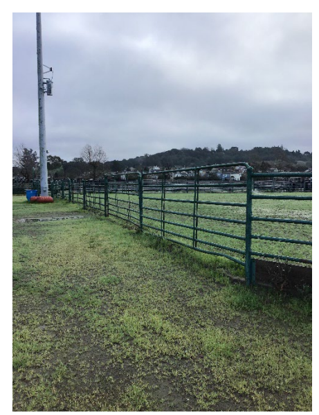
Powder River Gates and Panels One panel weighs up to 153 lbs. *Two-Person or Mechanical Lift ONLY*

Set-Up/Break-Down of Events-8' x 30" table - 61 lbs. 15 - 8 ft. tables with handle at 42" Push force = 46.37 lbs. / Pull force = 59.37lbs.