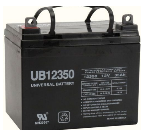
12 Volt Golf Cart Battery 8" x 5" x 6." = 13 lbs.