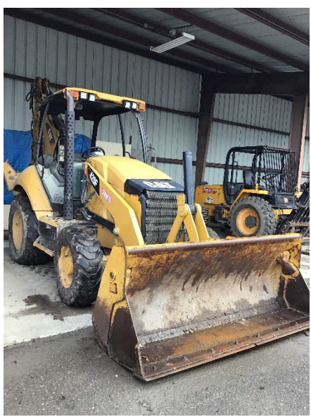
Sample of equipment to be maintained/repaired