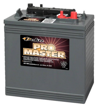
6 Volt Golf Cart Battery 10" x 7" x 11" = 58 lbs.