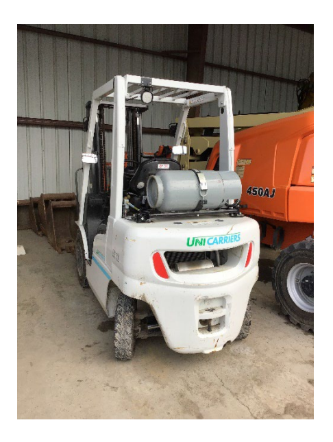
Propane fueled Forklift Tank lifted up to 47-inches