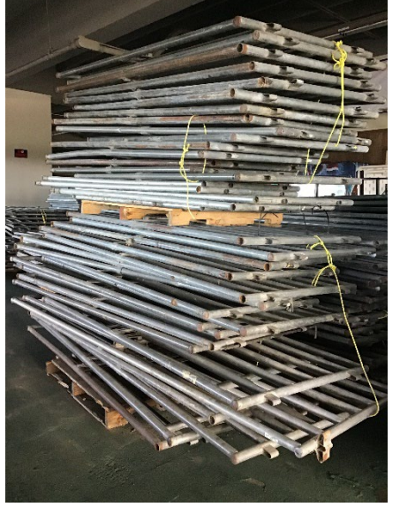
Small Livestock Portable Pens Moved around grounds on pallet by Forklift