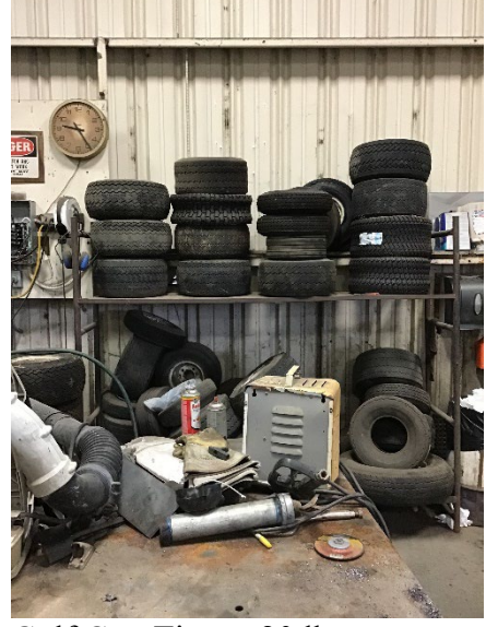
Golf Cart Tires – 20 lbs. Stored from floor to 76 inches