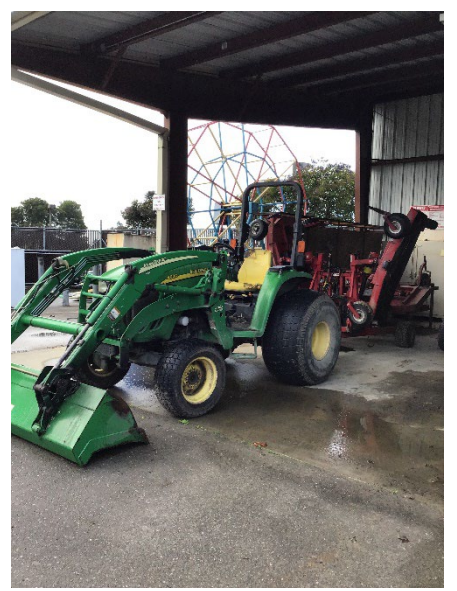
Sample of equipment to be maintained/repaired