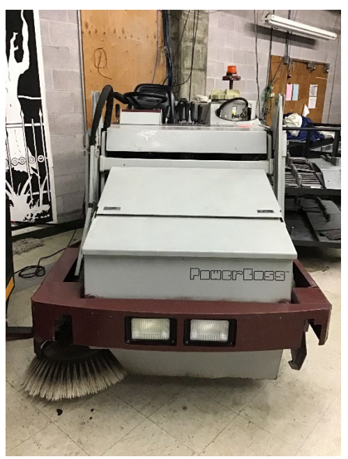
Riding Floor Machine