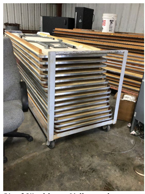
8' x 30" tables – 61 lbs. each 15 Table Rack/Cart with handle at 42" high Push Force = 46.37 lbs. Pull Force = 59.37 lbs.