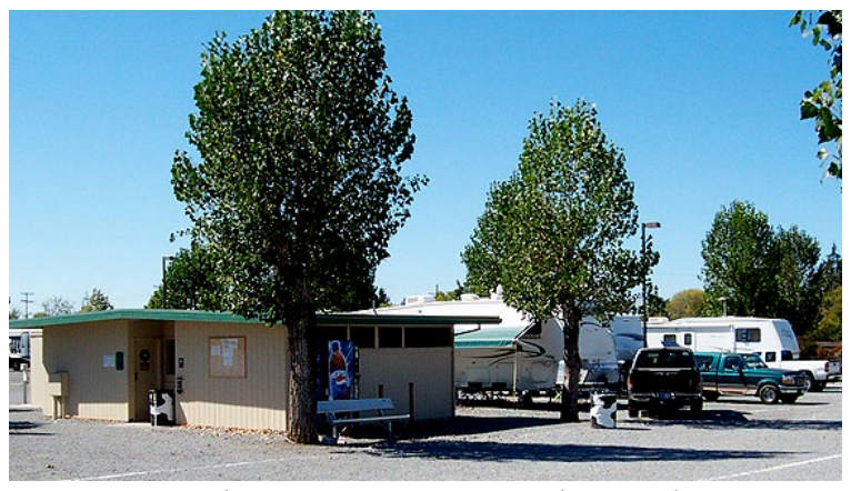
RV Park at Sonoma County Fairgrounds -Maintenance Workers clean and sanitize restroom -Maintenace Workers maintain landscaping in RV Park