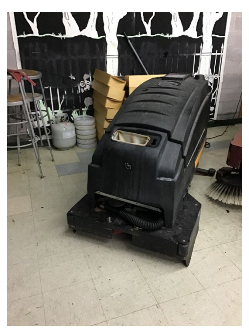
Push from behind Floor Machine