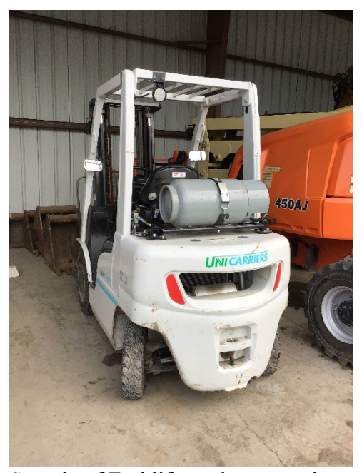
Sample of Forklift used to move large Items and equipment around grounds and facility