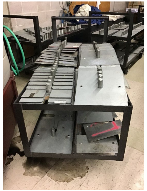
Bases for Exhibit Booths – 10 lbs. Lifted from the Floor to 32" cart