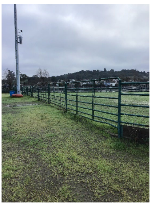
Powder River Horse/Livestock Fence/Gates Up to 153 lbs. per section