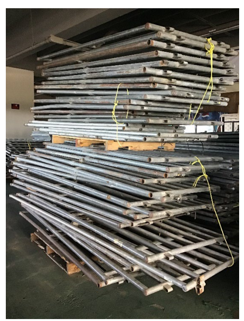
Portable Livestock Fence/Gates for smaller animals; Moved around grounds on pallets with Forklift